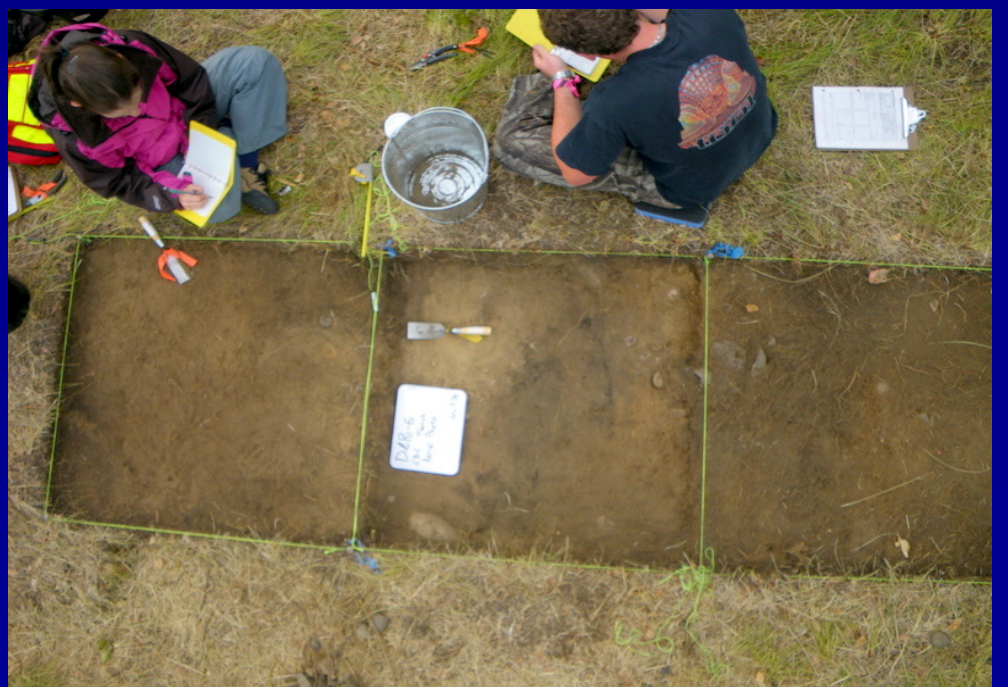
Excavation of a mid-1800s mat lodge. Research objectives for the project are to develop detailed culture history for the poorly-understood post-contact period in the Fraser Canyon.